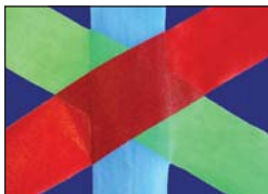
Made from non-porous 100% PTFE multi-directional TLFP Material.

Since THOR-SHIELD TLFP Spray Shield will be unaffected by even the most corrosive chemical environments, chemical capability tables do not need to be referenced.